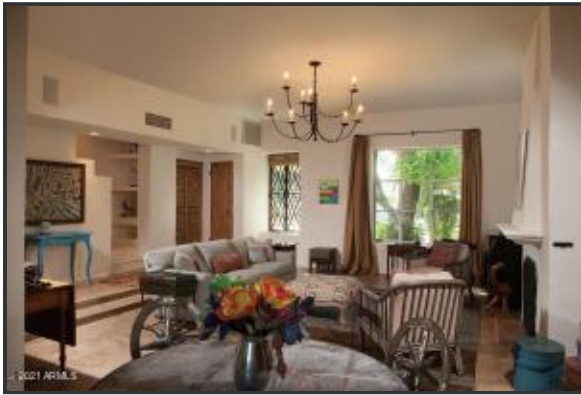
Enter into the warmth and beauty of historic charm, modernized perfectly for your comfort