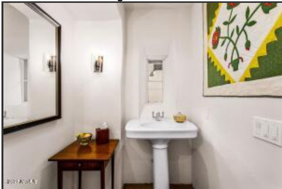
Modernized keeping with the historic charm