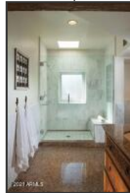
Walk in Shower provides spa feel to the upstairs master suite