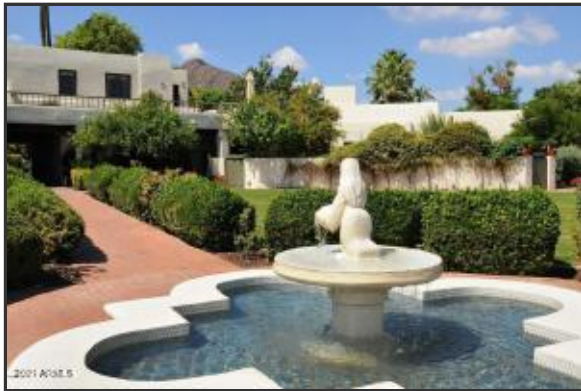
Unit #2 as seen from the Fountain