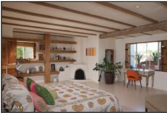
Master Suite is up its own private staircase with views to the rose garden