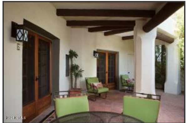
Covered Patio leads to guest casita and overlooks Rose Garden