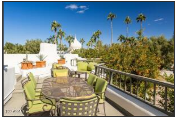
Spiral Staircase leads guests to rooftop deck for views of Camelback, Sunsets and the Rose Garden