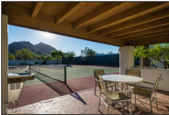
tennis at sunset