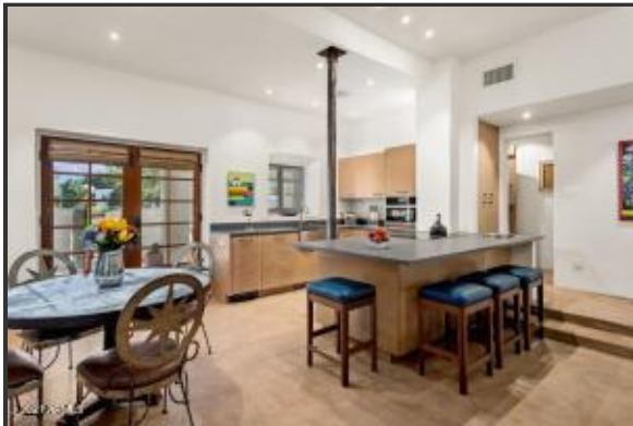
Adjacent Kitchen and Dining are Doors leading to covered patio overlooking Rose Garden Patio