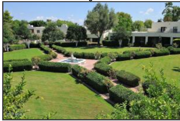
Fountain in center of Rose Garden