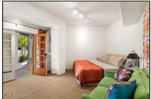
Guest Casita shares covered patio overlooking Rose Garden. Use for Guests or as an office.