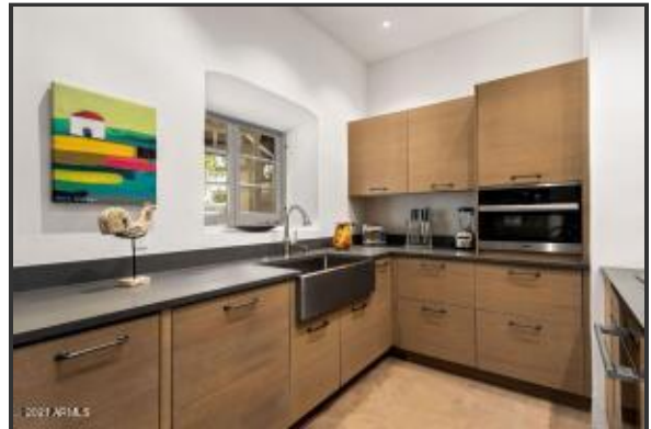
Modern Kitchen integrates the Adobe architecture that makes this true Casa Blanca