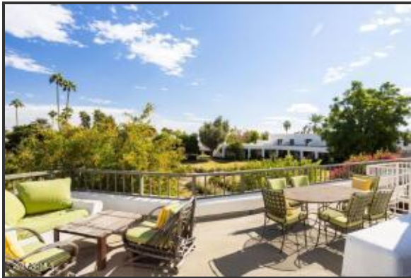
Roof deck space extends the square footage for entertaining and waiving to the amazing neighbors living here at Casa Blanca