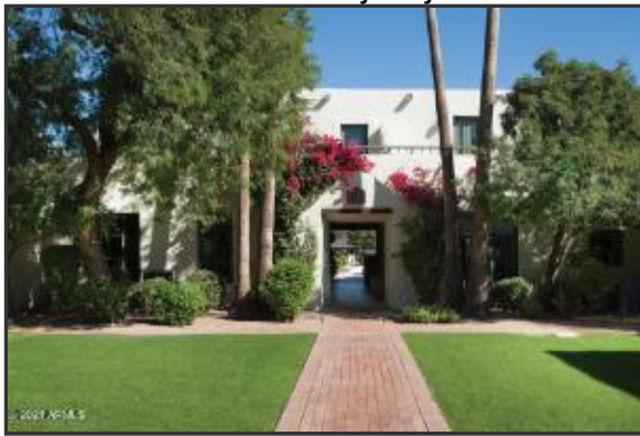
#2 is an interior unit, brick walkway to entrance door on your left