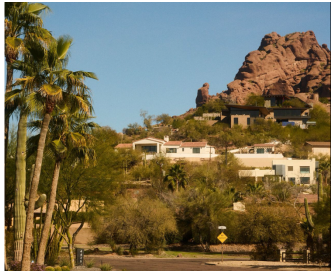
Figure 1 PRAYING MONK near Camelback Mountain's Echo Canyon trail